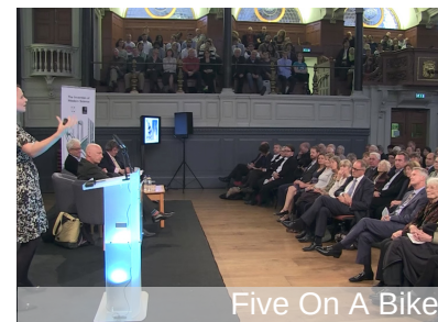
Five On A Bike