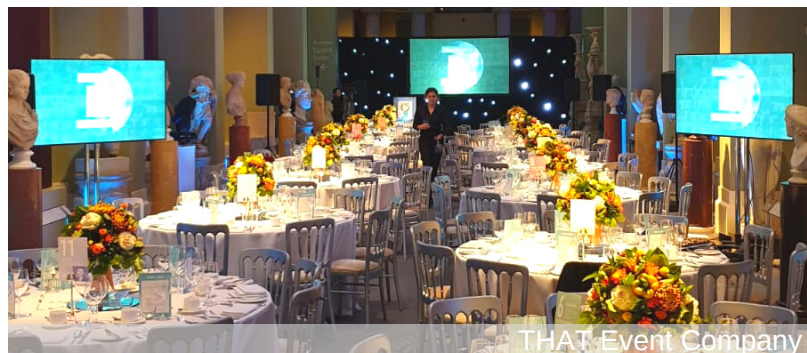
THAT Event Company